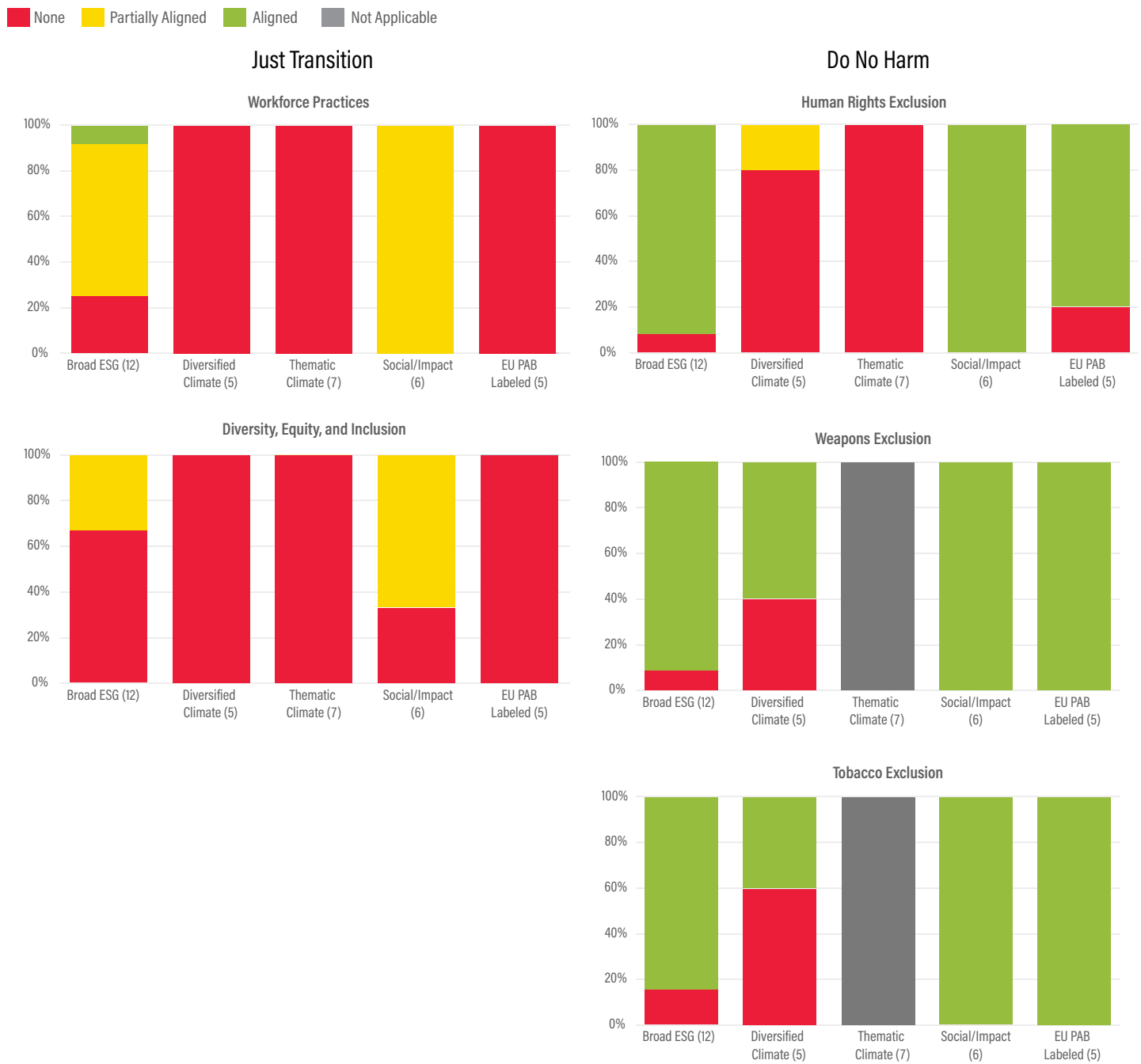
Figure ES-1 | Fund Evaluation Result against the Paris-Aligned Framework by Fund Category