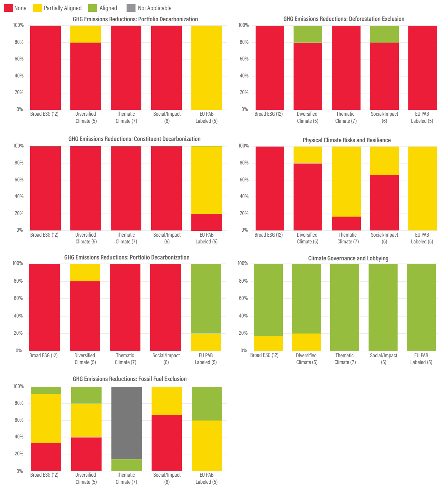
Figure 1 | Fund Evaluation Result for the Mitigation and Resilience Theme by Category

Note: ESG = environmental, social, and governance; GHG = greenhouse gas; PAB = Paris-Aligned Benchmark. The number of funds in each category is included in parentheses.