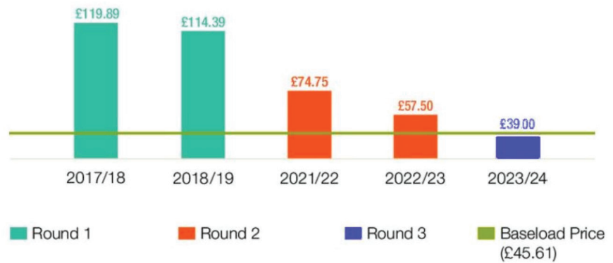
Figure 3: The UK Offshore Wind strike price from three successive rounds of CfD reverse auctions compared to the current baseload electricity price 17