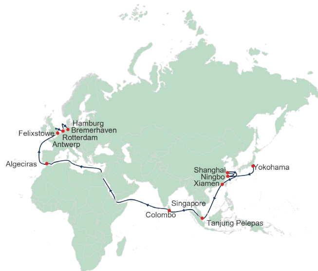
Figure 4: The Asia-Europe container route

The analysis of the Asia-Europe container route also provides an indication of the potential funding levels required to decarbonize the route. There could be as many as 50 new-build zero-emission vessels deployed on the route by 2030, 30 which is roughly 17 per cent of container capacity. 31 While 12 billion euro in capital expenditure is required by 2030 32 on the route to support these vessels, 33 the total cost of ownership for a zero-emission vessel is expected to be only 25 per cent 34 more expensive than fossil fuel powered vessels once shipping has been integrated into the EU ETS.